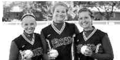
Homerun Hitters x3 vs Guerin Prep