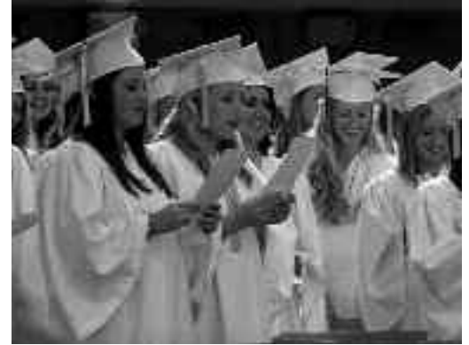
Above: The Class of 2011 sang "Daughter of God" prior to receiving their diplomas.