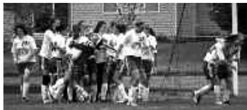
Celebrating their 3rd straight Regional title!